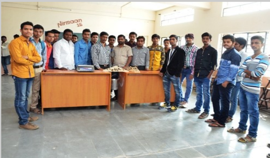
Truss Model Making: Student Participation